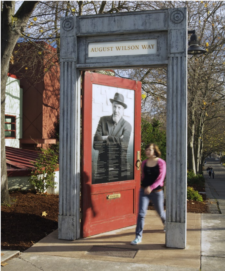
all photos on this page © 2008 Michael Cole